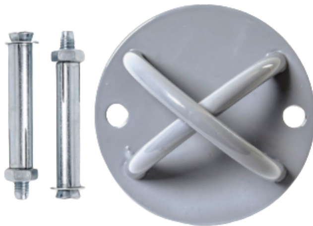
Concrete anchor bolts